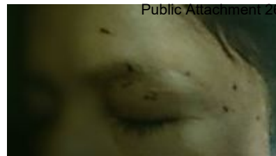
Outrage after rapist jailed with victim