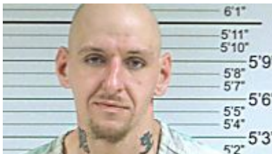
Pennsylvania groom 'choked bride' in wedding gifts row