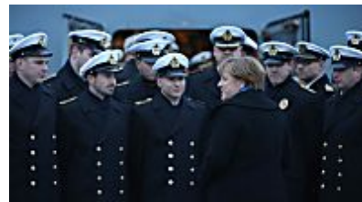
Germany: Reluctant military giant?