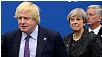
Newspaper headlines: Senior Tories 'urge Boris to topple May'